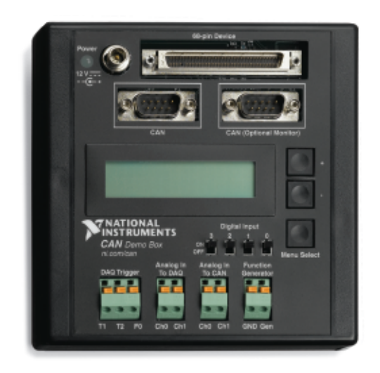
Figure 1. NI CAN Device Simulator

The NI CAN Device Simulator has a function generator, one highspeed CAN interface, one high-speed CAN monitor connector, a 68-pin DAQ connector, access to the DAQ interface TRIG1, TRIG2, and FREQOUT pins, and digital input switches.