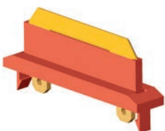
50A / 100A Collector Shoe and Holder 310993