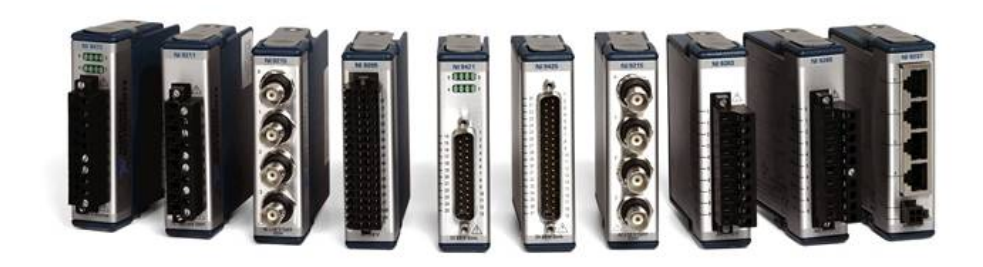
Figure 2. You can choose from more than 50 NI C Series measurement modules.

You can choose from more than 50 NI C Series modules for different measurements including thermocouple, voltage, resistance temperature detector (RTD), current, resistance, strain, digital (TTL and other), accelerometers, and microphones. Each C Series module combines sensor connectivity, signal conditioning, and A/D converters into a small 2.8 by 3.5 in. package. Channel counts on the individual modules range from three to 32 channels to accommodate a wide variety of system requirements.