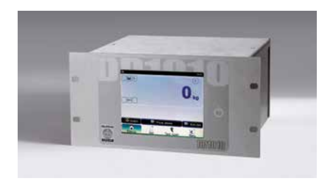
DD1010 Rack version