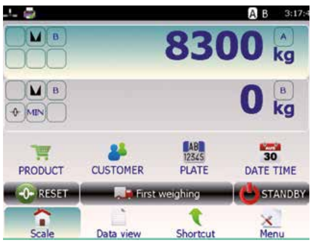
2-scale weighing system

The possibility to customize the main screen keys as needed by dividing the most frequently used icons into groups makes it extremely user-friendly.