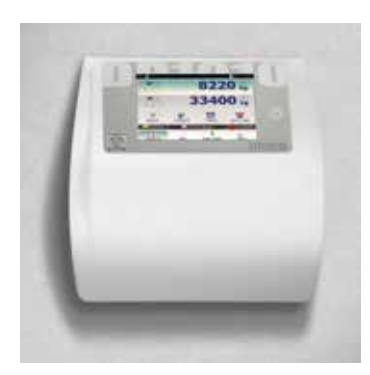
DD1010 Wall-mounted version