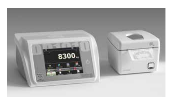
DD1010 Equipped with STB Q3 printer